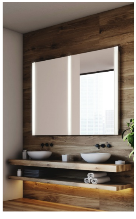
Sizes range from 12"W to 23"W in single door for your own customizable design.